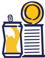
Steel & aluminium cans (no aerosols)