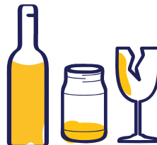
Glass bottles & jars (rinse and remove lids)