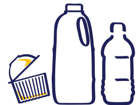
Plastic bottles & containers (lids removed, no soft plastics)

NO material in bags (all recyclable material should be placed loose in the bin)