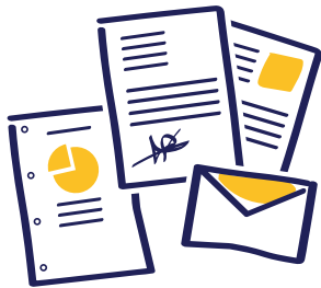
Paper (not shredded)

ALL ITEMS SHOULD BE CLEAN, DRY AND EMPTY WITH LIDS REMOVED AND PLACED IN THE BIN LOOSELY.