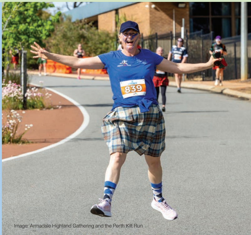
Image: Armadale Highland Gathering and the Perth Kilt Run

"For some it was the chance to reconnect with their roots, for others it was the chance to don a kilt for a day and experience some Scottish culture at its best."