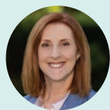
Mayor Cr Ruth Butterfield