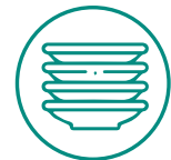
Disposable Plastic Plates