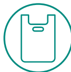
Any Plastic Shopping Bag with Handles