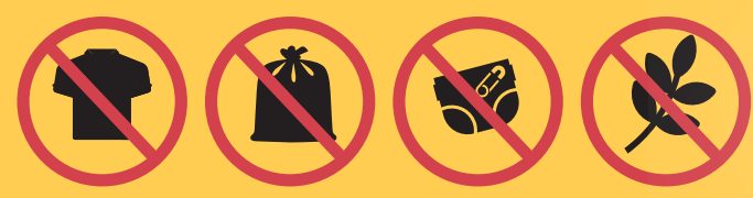
Clothing or textiles Bagged recyclables Nappies Food or garden organics