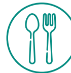
Disposable Plastic Cutlery