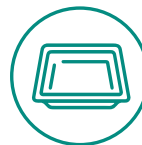
Disposable Plastic Food Containers (without lids)