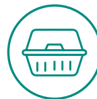
Expanded Polystyrene Food Containers & Trays