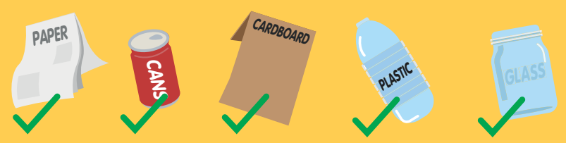
Paper Cans Cardboard Plastic bottles and containers Glass jars and bottles

Recycling is simple: it's only these 5 things that go into your recycling bin (yellow lid)