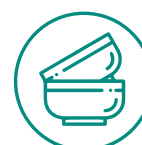
Disposable Plastic Bowls (without lids)