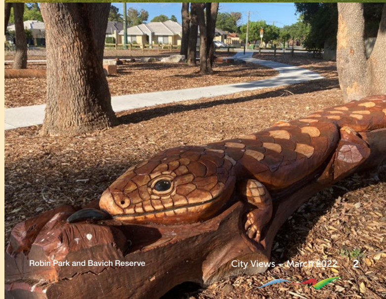
Robin Park and Bavich Reserve