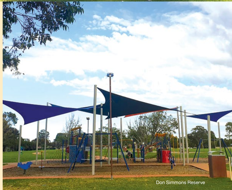
Don Simmons Reserve