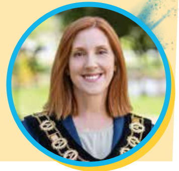
Mayor Ruth Butterfield City of Armadale