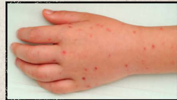
Swollen ankle joint (top) and rash in a RRV patient.