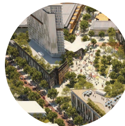
Armadale Station Central Park