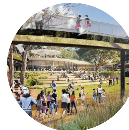
City Views - Civic Precinct Redevelopment