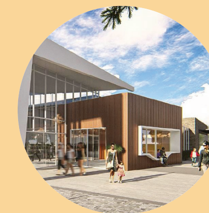
Hilbert District Community Centre and Library