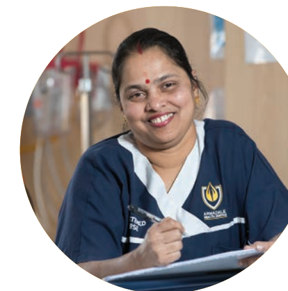
Armadale Regional Health and Medical Precinct