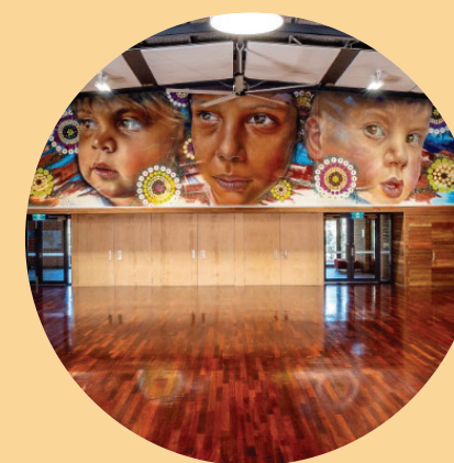
The Champion Centre