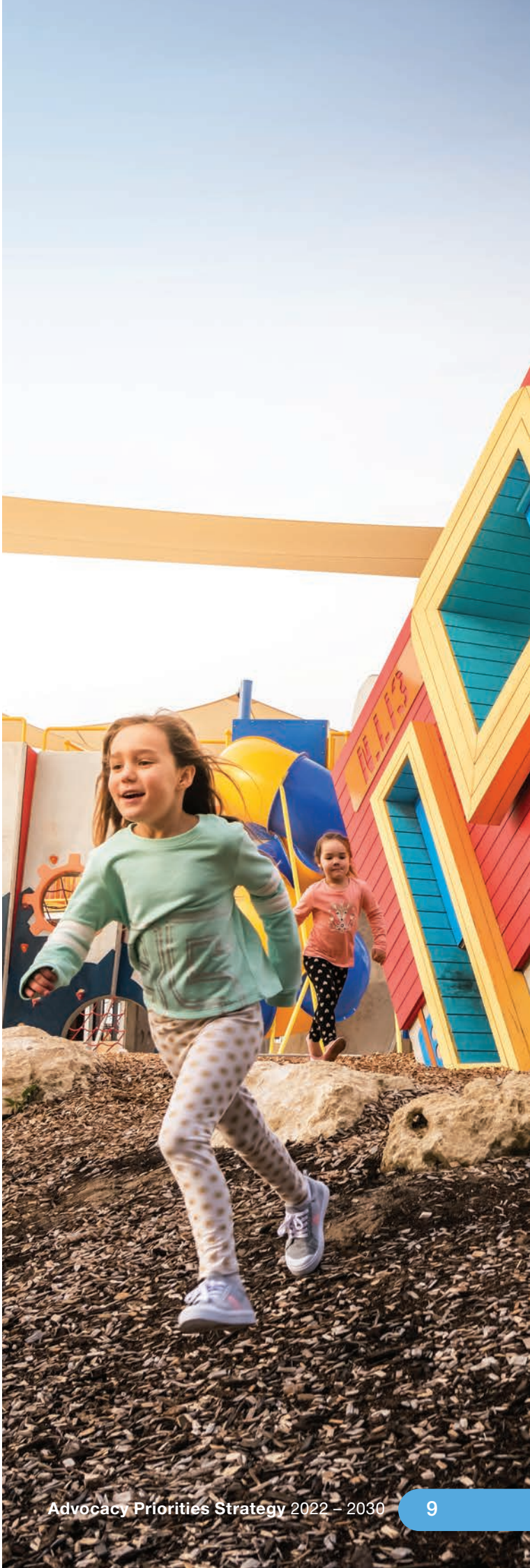
Image: Robot Park, Piara Waters.

The City of Armadale represents the region's views at round tables, task forces, and other strategic forums.