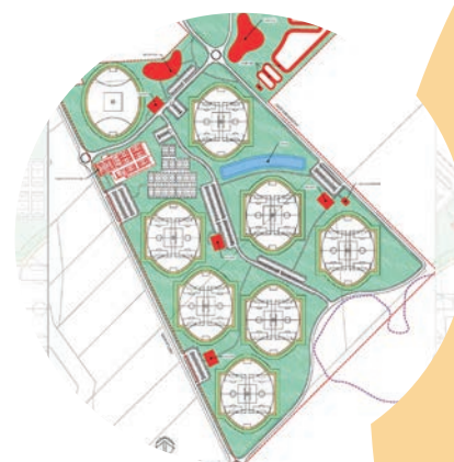
Armadale Regional Recreational Reserve