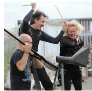
MotET Electronic Technomages