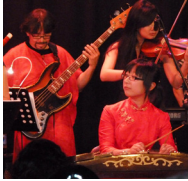
Crystal Jade Traditional Chinese Ensemble