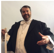
Flabalotti Operatic Comedy