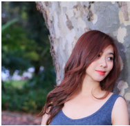
PCB Contemporary Mandarin & Cantonese Pop