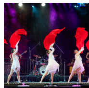
Chung Wah Dancers Dazzling Chinese Dance