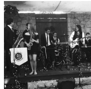
Two Cent Professionals 10-piece Party Swing Band