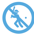
Lack of Recreational Activities