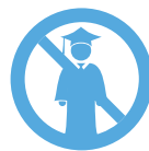
Lack of Education Opportunities