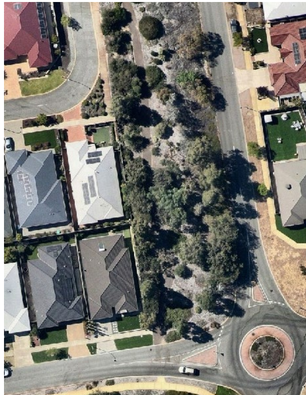
Image 7 (Aerial view of Number 53 Archdale Loop and 60 Guerin Avenue).

Number 53 Archdale Loop and 60 Guerin Avenue (Image 7) were assessed for mature trees growing over residential properties; no significant over growth was identified along 53 Archdale Loop (Image 8), whilst there was notable dense growth along the fence line of 60 Guerin Avenue (Image 9). It is recommended that the City prune the vegetation away from the fenceline of 60 Guerin Avenue.