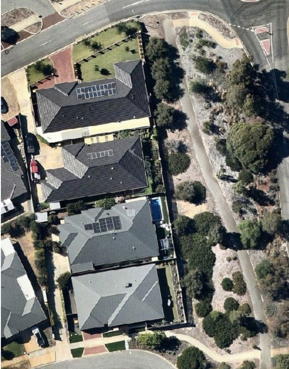
Image 5 Aerial view of Number 36 and 38 Pleasant Avenue and 61 and 63 Archdale Loop.

Number 36 and 38 Pleasant Avenue and 61 and 63 (Image 5) Archdale Loop were assessed for mature trees growing over residential properties; no significant over growth was identified (Image 6).