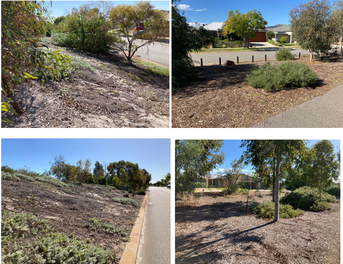
Image 5 (Example of areas that could be improved with replacement tree and shrub planting).

The City does not have a program for the replacement of dead trees and shrubs in this area. The Columbia Parkway Gardens were established as part of a development in 2011. Since 2011 the vegetation has been well established, though it is recognised that infill planting of trees to attain higher level of long term canopy and shrub understory after twelve years is an activity that would be beneficial to the City's environment (Image 5).