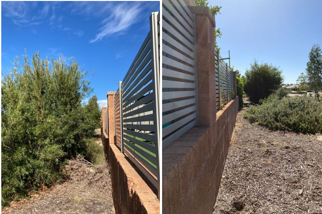
Image 6 (Fence line of Number 36 and 38 Pleasant Avenue and 61 and 63 Archdale Loop).

Number 53 Archdale Loop and 60 Guerin Avenue (Image 7) were assessed for mature trees growing over residential properties; no significant over growth was identified along 53 Archdale Loop (Image 8), whilst there was notable dense growth along the fence line of 60 Guerin Avenue (Image 9). It is recommended that the City prune the vegetation away from the fenceline of 60 Guerin Avenue.