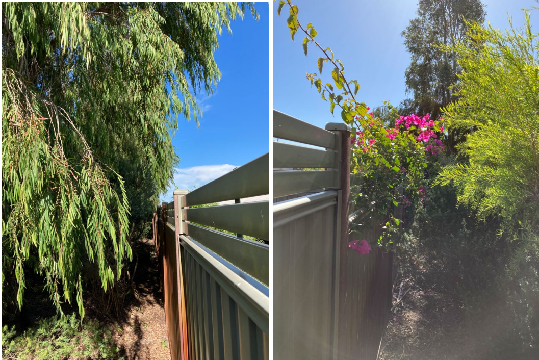
Image 8 (Fence line of Number 53 Archdale Loop; note that the Bougainvillea is growing from the residents property).