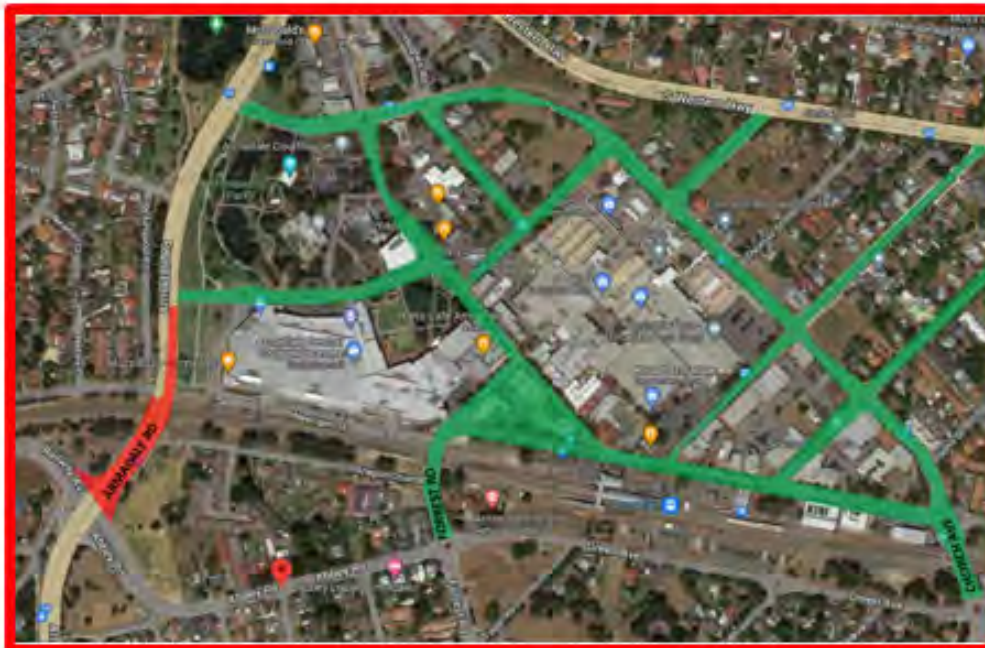
Armadale Road Closure