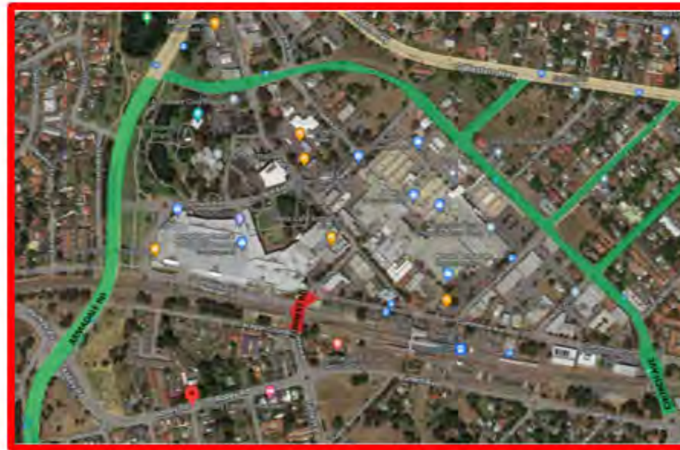
Forrest Road Closure