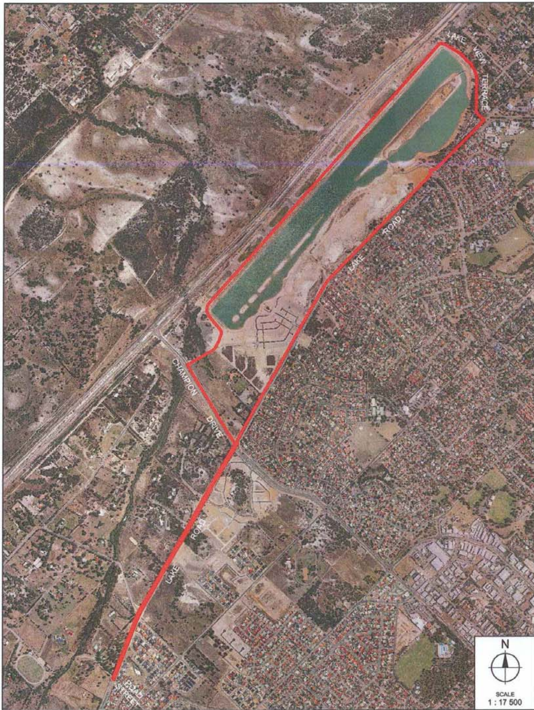
LOCATION PLAN GOLDEN SPOKES CYCLE EVENT