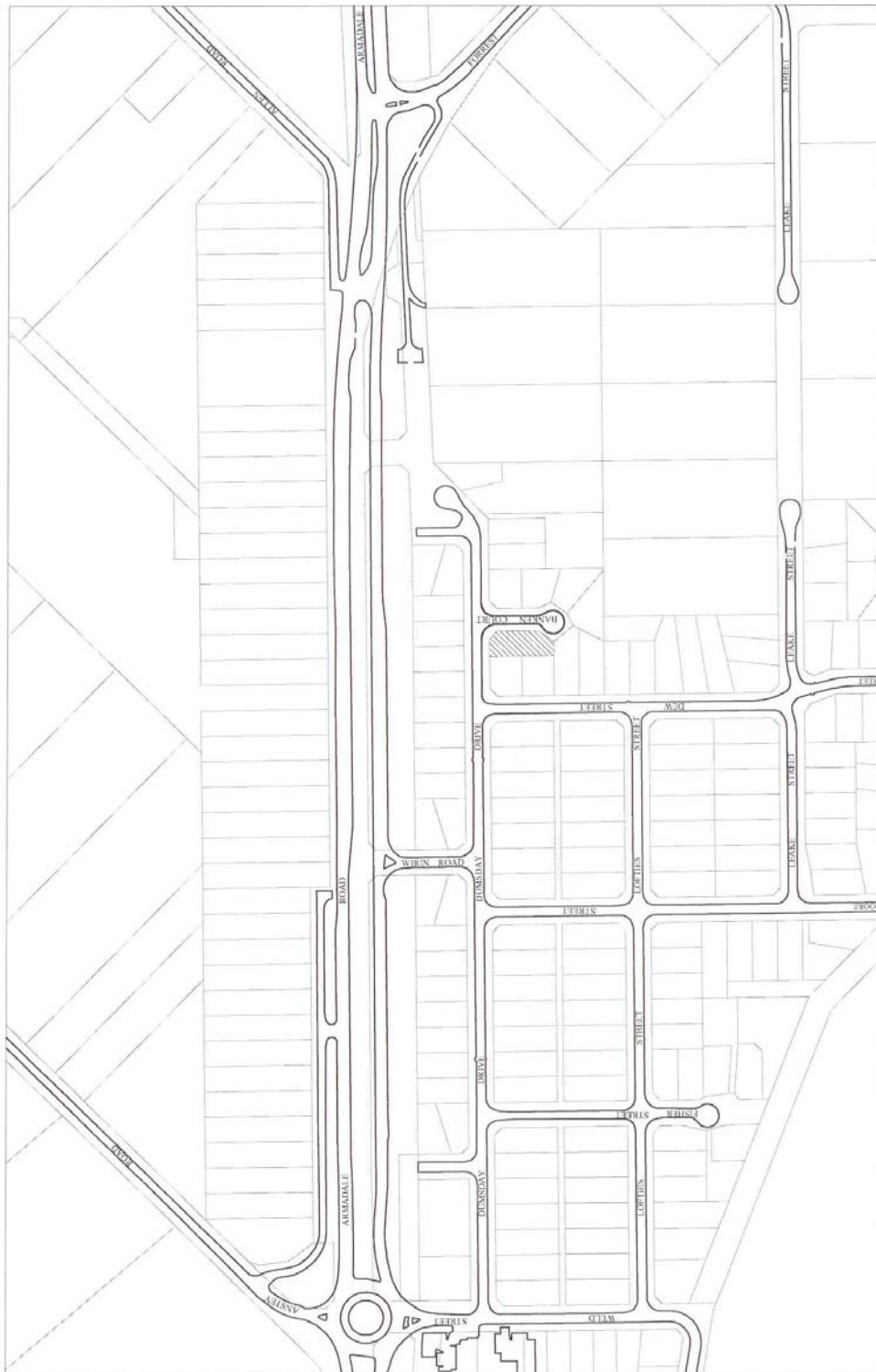
BANKEN COURT LOCALITY PLAN NTS