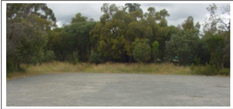
Proposed site – PCYC Hall car park