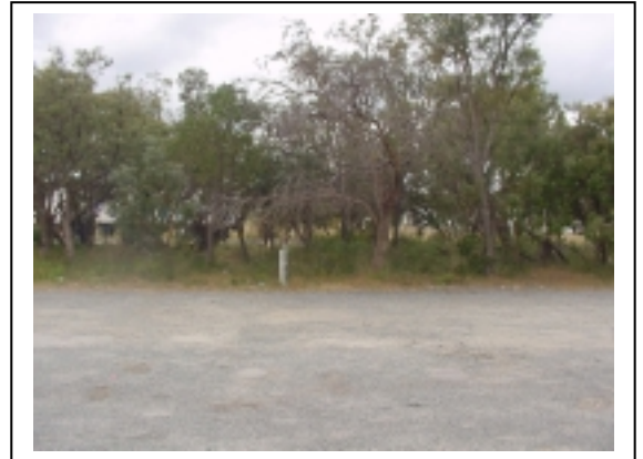
View from the site looking through to Champion Rd. Area to be cleaned up to create clearer viewing.